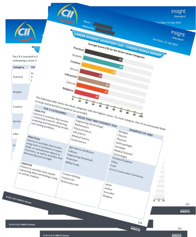
Career Interest Inventory (CII) Sample Insights

MIMOS is the leader in ICT innovations, pioneering new market creations for partners through patentable technologies for economic growth. For more information about MIMOS, call (603) 8995 5000 or (603) 8995 5150 or go to www.mimos.my .